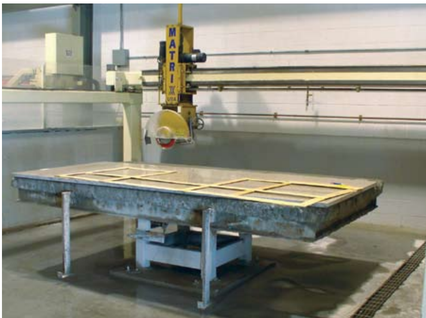
Prior to sawing, Luan plywood templates are laid out on the workpiece.

The Massachusetts office/showroom/shop has 20,000 square feet of space, while the Ft. Meyers location has 12,000 square feet of space. DeOliveira carefully configured the shop -- and expansion -- so that the flow of the workpieces is as smooth as possible, and the company can easily locate any project at any time. There are separate rooms for sawing and edging/finishing, and material is maneuvered with a 1-ton overhead crane. Jobs are also transported and staged using carts from Braxton Bragg, and DeOliveira said the company has 50 carts in all.