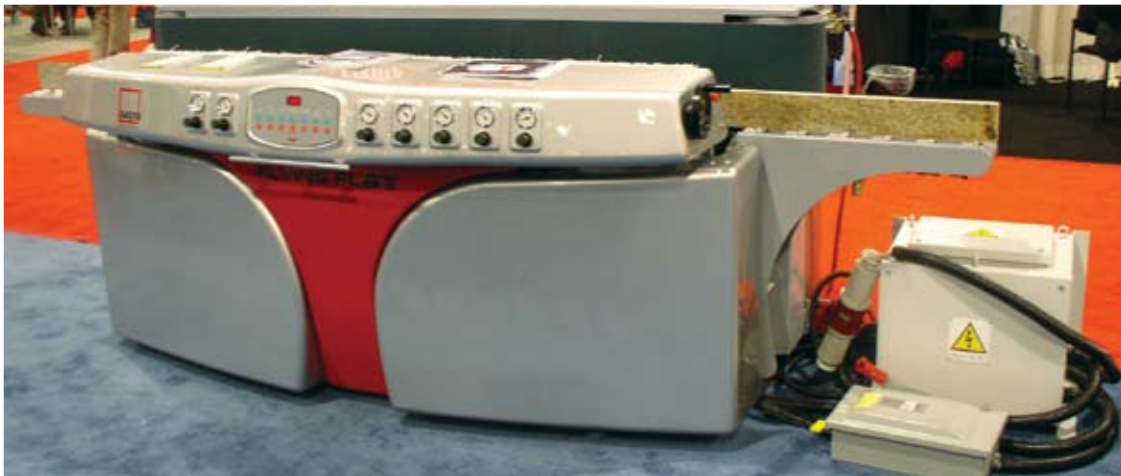
The company is also investing in two Sasso Flying Flat automated edge polishers from U.S. Granite Machinery — one for each location.