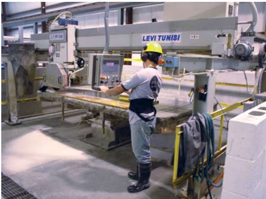
The Millbury location operates a programmable Levi Tunisi bridge saw, which it purchased from International Machine Corp. of Holbrook, NY.